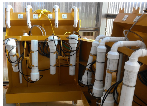
Photo: GVF Rootwasher Hydroneumatic Elutriation System