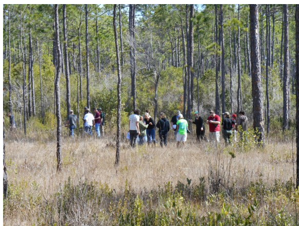
Photo on left: WIS4443C Wetland Wildlife Ecology class on their area wetlands field trip on March 8 th . The students were visiting a depression marsh on Eglin Air Force Base in this picture. During this trip they also visited a seepage slope in Black Water River State Forest.