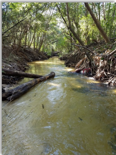
Carpenter Creek, Pensacola, Florida