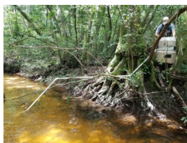
An automatic stormwater sampler is positioned on the bank of Carpenter Creek to take water samples during an approaching rainfall event.

Masters student Traci Goodhart measures streamflow in Carpenter Creek, Escambia County, Florida